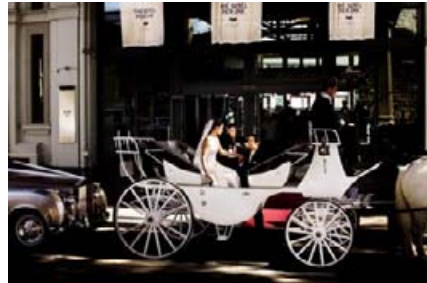
Arriving at front entrance