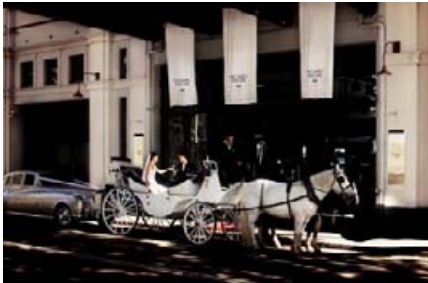
Arriving at front entrance

Congratulations | about us | packages | menus | beverages | additions | suppliers | accommodation | gallery | FAQs