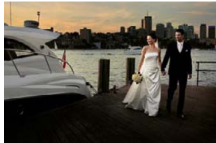
Hotel's Private Pontoon