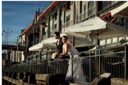
Overlooking Walsh Bay