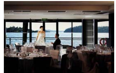
Dawes Point Room