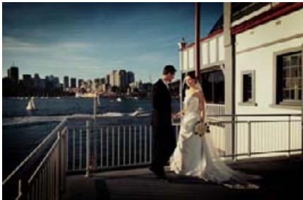
HarbourWatch Room Balcony