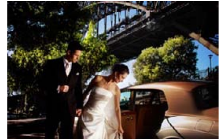
Arriving at front entrance